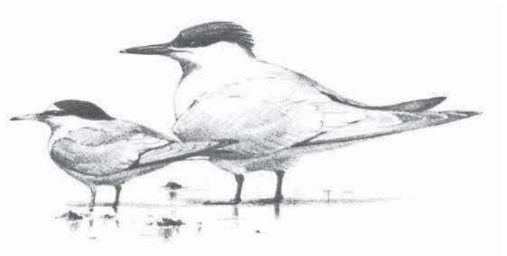
Little Tern A very small coastal tern (above) compared with a Sandwich Tern