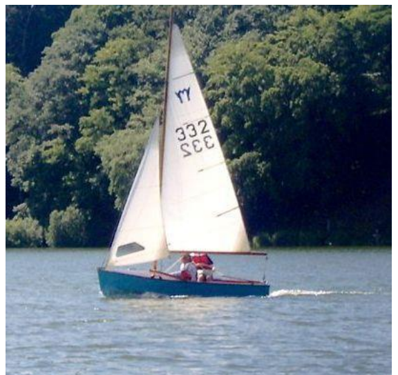
A Mayfly dinghy (replacing original image of Liz's boat which was poorly reproduced)

To make room for sleeping, my Galley Box has to be moved, but it sits quite happily on the side-bench up forward and is easily accessible if required.