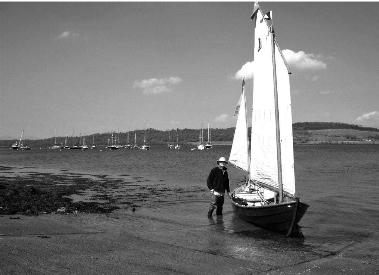
Alan and Lowly on the slip

Day's distance 12 n.m. / Total distance 128.4 n.m. AG